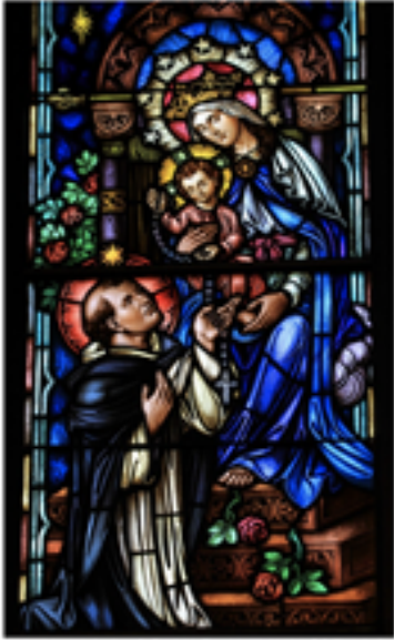
Stained glass window from St. Dominic's Church in Washington, D.C.

In the Church Liturgical Year, the month of October is dedicated to The Holy Rosary. The feast of The Holy Rosary is celebrated on October 7th.